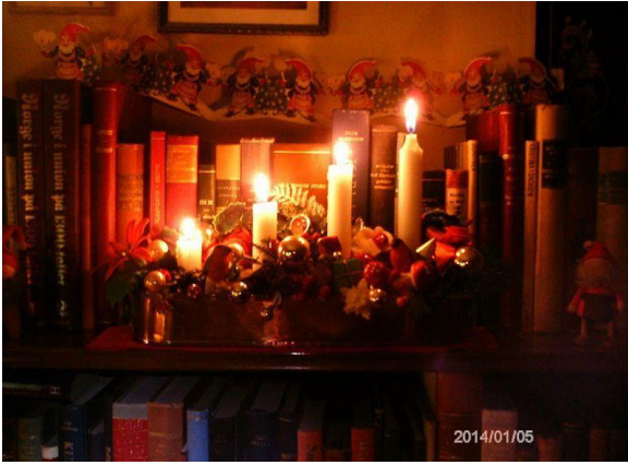
Yule Log with the four candles of Advent.